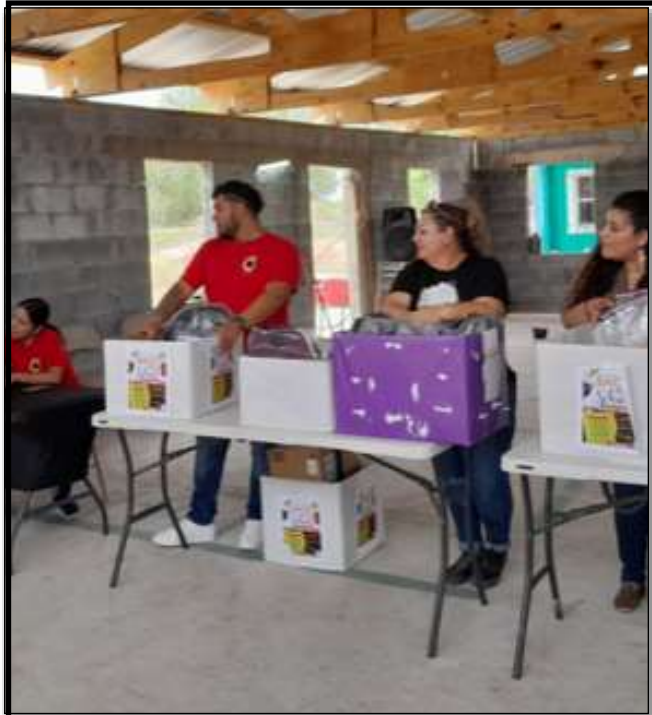
The TCCI Team in the Rio Grande Valley hosted a back to school event in El Dora Colonia in Donna, Texas this fall.

T his fall, the runaway and homeless program team in the Rio Grande Valley, helped local children with school supplies, clothing, canned goods and 52 backpacks in a back-to-school event. The event was held in the El Dora Colonia in Donna, Texas.