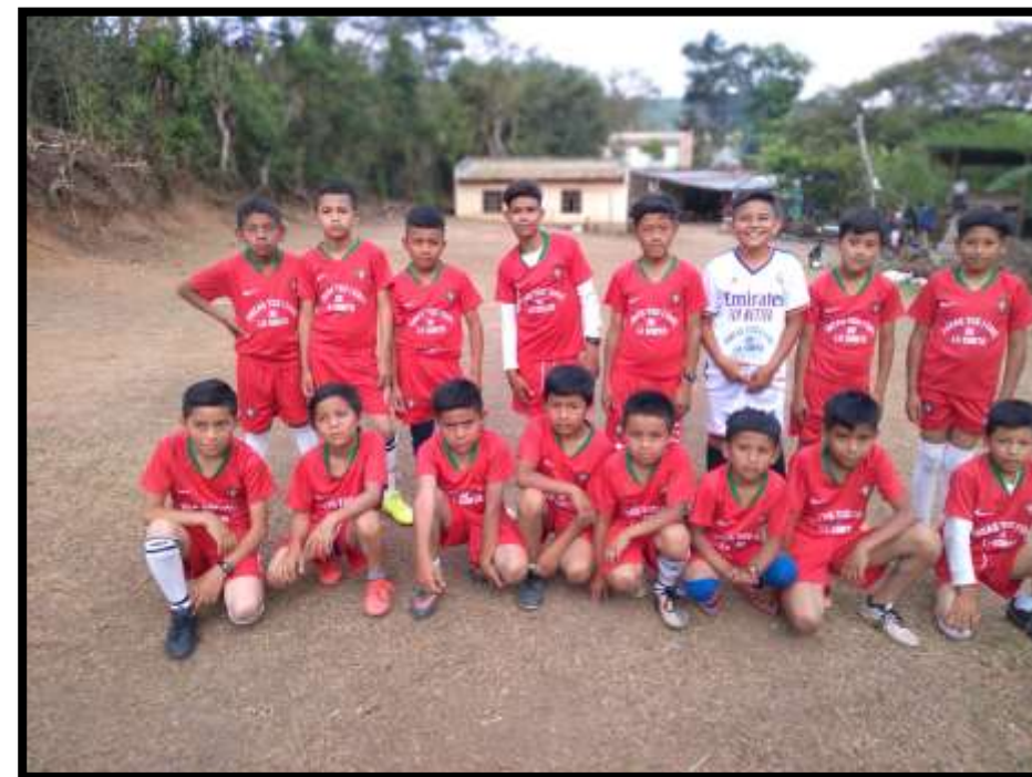
The Children's Center's CAFÉ Project sponsors youth soccer team, pictured here, in La Sorto, Intibuca, Honduras. Most are Children of local coffee producers.