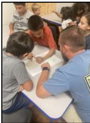
Mentoring with the TideChangers