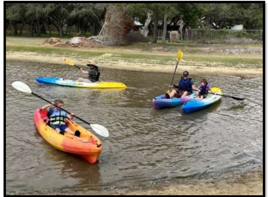
Learning boat safety and kayaking

The BASIC Center programs support runaway and homeless youth. Youth are served by engagement in emergency shelter, crisis intervention, crisis stabilization, crisis prevention and other services. All of these activities, including the TideChangers project, create positive outcomes that align with the Comprehensive Youth-Center Services that are a primary component of the BCP mission.