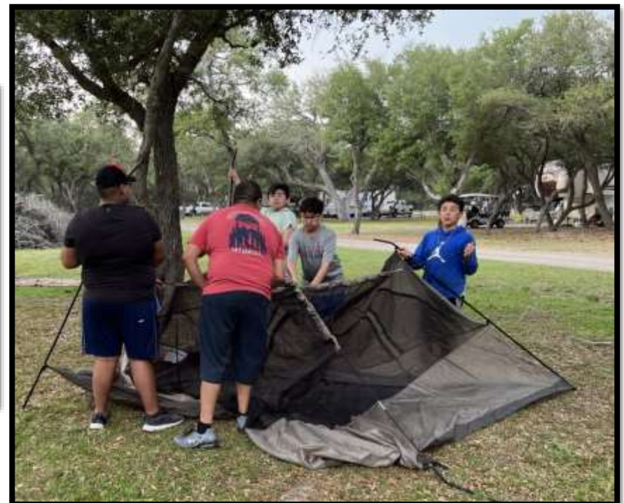
Teamwork lessons while learning the challenge of putting up a tent.