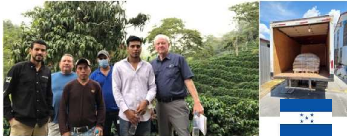
Volcafe Way Demonstration Farm, Finca Las Moras, Siguatepeque, Comayagua, Honduras