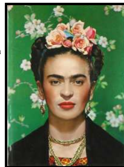
Frida Kahlo, famous Mexican Painter, kept a Journal